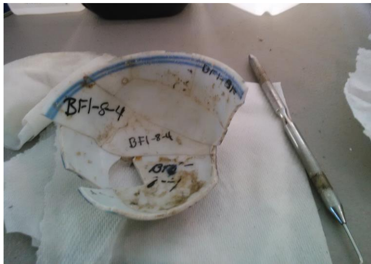
An Area-B artifact pre-cleaning