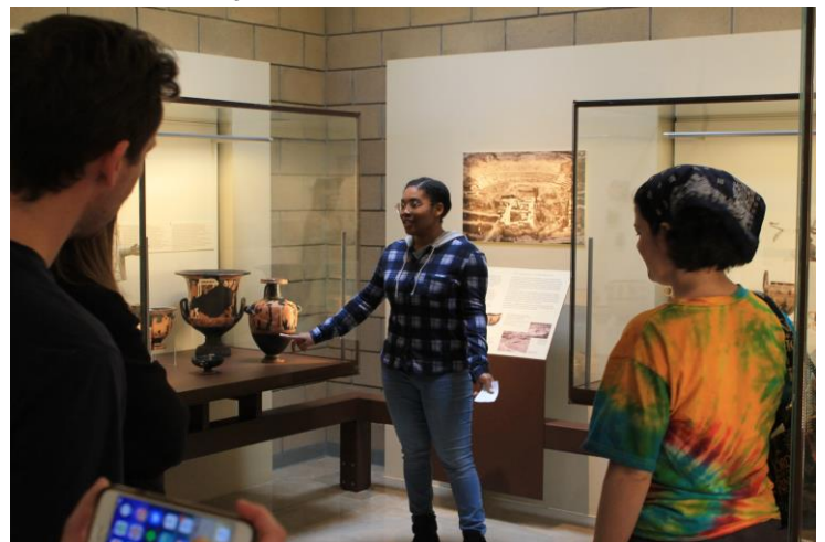
Presentation at the Archaeological Museum of Thebes