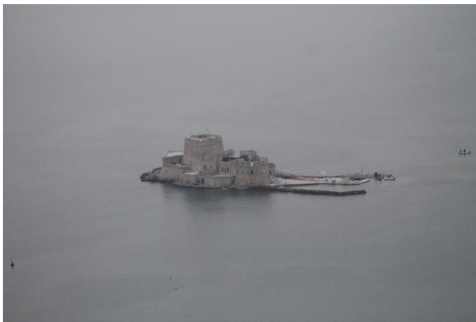
A close-up of the Bourtzi

The express aim of this death march was again to view the sunset—at least as much as we could through the pall of Saharan dust that filled the upper reaches of the sky and reminded us of how close the shores of Africa are to Greece. Even in the strange gray light we could discern the Cyclopean walls of Bronze Age Tiryns, some three miles to the north, which perhaps was the na-u-pi-ri-ja ("Nauplia") of Mycenaean records. Directly below, in Nafplio's harbor, sits the fortified islet known as "the Bourtzi." This is the Greek rendering of the Arabic word for "tower," by way of Turkish, which ultimately is related to ancient Greek pyrgos "tower" and phyrkos "fortification"—two more words whose