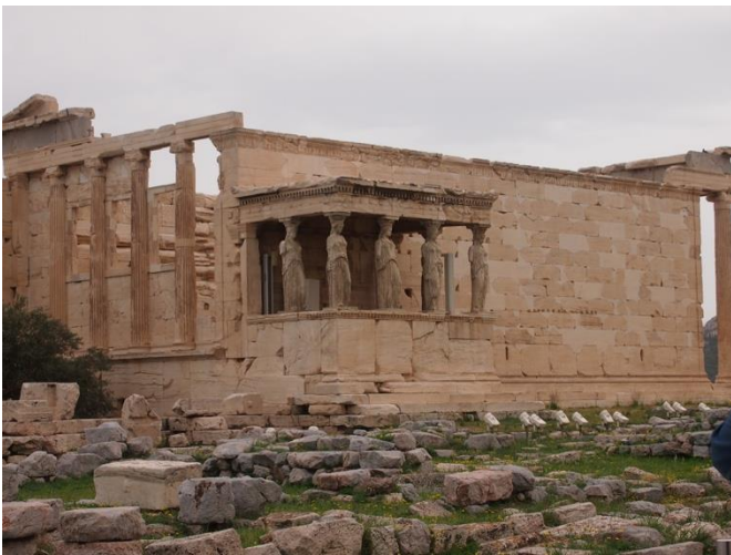
Karyatid Porch of the Erechtheion

While taking the ANCS 301 class over the winter session, everything felt very familiar. Quizzes on pottery and myths were the norm, and though I learned something new in every class, it was another addition to my knowledge of an ancient world that did not seem to exist outside of a classroom.