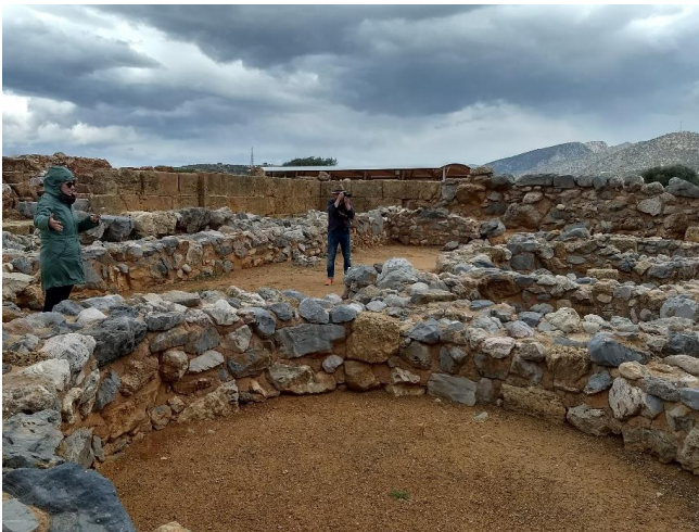
Grace Ghinger soldiers on with her presentation on kouloures as Zeus thunders above.

That night, we saw a strange orange-clouded sunset from the Palamidhi fortress in Nafplio, Greece's old capital, where we also visited the museum containing one of my favorite artifacts—the Dendra Panoply. We found out later that a dust storm had blown up from Libya, casting Saharan sand across the Aegean and shrouding Crete in a red sandy haze. We saw the evidence of the storm as soon as we landed in Crete the next day: sand drifted in eddies over car lots and streets until rain began to wash it all away.