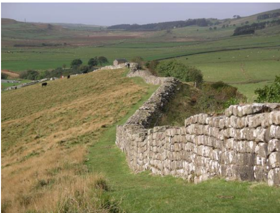
Hadrian's Wall near Greenhead Lough