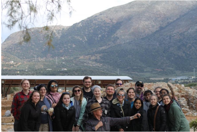
We take advantage of a break in the weather for one last group photo at Malia

reconstruction. Phantom walls rose, and the dead lived again in our minds; we could almost see the potters eyeing the basket weavers as they imitated each other's art.