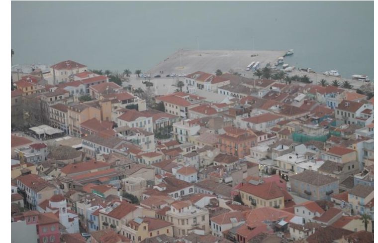
A view of Nafplio from the Palamidhi

"Death March 2" offered its own astonishing views of natural and human wonders and curiosities. We ascended the 900-plus steps to the gate of the 18 th -century Venetian fortress on the Palamidhi peak, which rises over 700 feet above the coastal town Nafplio in the Argolid. Nafplio's narrow streets offer shelter from the sun in summer, and traditional crafts, gelato, and photo opportunities for cats at any time. With imposing sculptural reliefs of Venice's Lion of St. Mark on the fortress walls, it is easy even for classicists to forget that this peak is named for the hero Palamedes, son of eponymous Nauplios, who detected Odysseus' feigned madness at Ithaca before the Trojan War.