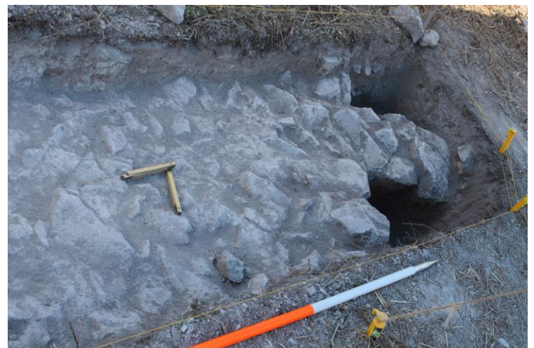
Figure 2: Medieval pavement atop the dike in the plain