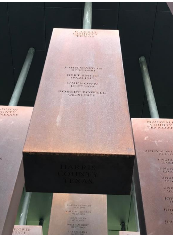
Column for Harris County at the National Memorial for Peace and Justice

I saw another place this summer that brought this truth of visibility home. I was in Montgomery, Alabama, and visited the new National Memorial for Peace and Justice that commemorates the victims of lynching. As you walk around the memorial, dangling steel columns represent each county where lynchings took place, inscribed with the names of the victims,