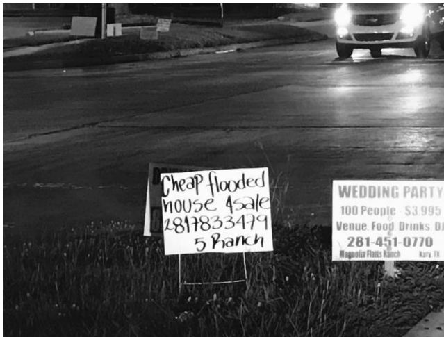
A sign in Katy, Texas advertising a flooded home, two months after Hurricane Harvey

I've sometimes thought that I chose to study the archaeology of the ancient world because I grew up in a place that seemed to have no past. If you actually traced my path through fluctuating interests and opportunities, the story would be more complicated, but at the heart of it, I think, is still a vast expanse of concrete and square lawns, built in the 70s, 80s, and 90s, and more of the same thing for miles and miles, interspersed with clusters of McDonalds and Walmarts like beads on a string. I tried to write poems in high school, none of which was very good. But when I go back and read them now they are remarkably consistent: all about empty landscapes and an inability to feel any connection to place.