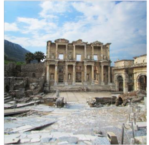
Façade of the Library of Celsus, Ephesos

I still wish I spent more time at Ephesus, but in retrospect I could have spent an entire day and still not have been satisfied. To see the Library in the flesh (well, in concrete, to be precise)—such an iconic part in my education—was an actual dream come true and something I will never forget. I can only hope that one day I will have the opportunity to visit Ephesus again, because once was not enough.