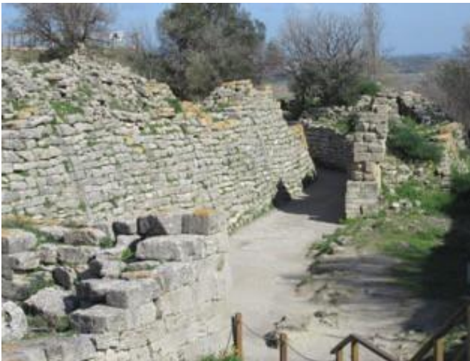
The Walls of Troy