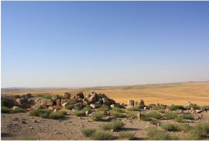
El-Mreigha, Kerak Plateau, Jordan

In the summer of 2014, I went on a quest for an excavation site in Jordan. I got lost, I was chased by wild dogs, I accidentally crashed a wedding, but in the end I did find some promising places—and made it back in one piece.