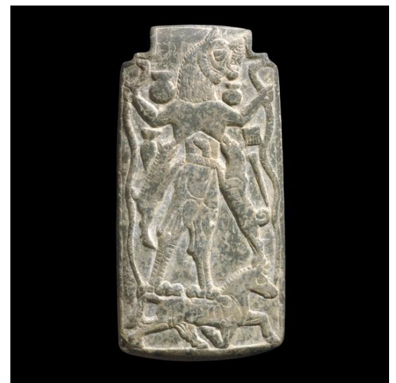
Amulet Depicting Lamashtu,

One example I used to underline this aspect concerned the manner in which the ancient Mesopotamians dealt with infant death. Infant death was often attributed to a baby-snatching demon called Lamashtu, who would come uninvited and "steal" babies from their mothers. Portrayed as having the head of a lion, the teeth of a donkey, and the feet of a bird with sharp talons, Lamashtu is most famous for