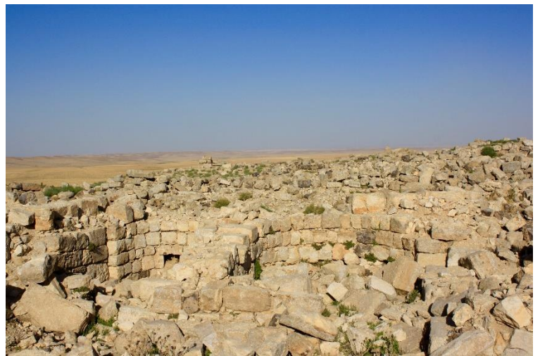
El-Mreigha, Kerak Plateau, Jordan

I concentrated on north and central Jordan. I quickly learned that driving anywhere took me about twice as long as I had estimated. Large highways were fine, though I sometimes had to stop for military checkpoints, but smaller roads often turned out to be private dirt roads, driveways, nonexistent, blocked off, or too steep for my tiny car to climb. They were also narrow, so a wrong turn meant a long reverse. Cities, meanwhile, were crowded, with stoplights, pedestrians, and sometimes livestock. In the north and in Amman, beggars came up to me frequently, which used to be unusual in Jordan. But their numbers have increased recently due to the refugees from the civil war in Syria. Meanwhile, the Bedouin have managed to trade their traditional tents for the hardier UN-issued refugee tents.