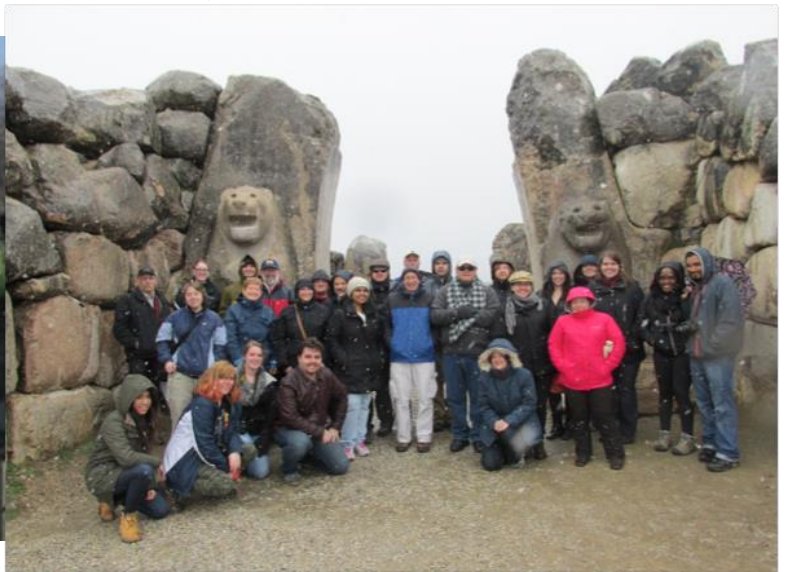
The Lion Gate, Hattusa