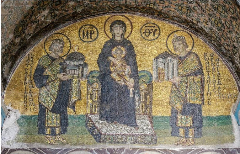
Constantine (R) offers the City of Constantinople to the Mother of God and the baby Christ, while Justinian (L) offers the Church of Hagbia Sophia to the pair.

Three members of the Ancient Studies faculty traveled throughout Turkey with 28 students, alumni, and members of the community from March 14 through 23, 2015. The trip was divided into 4 2-night stays: Istanbul, Çanakkale, Ankara, and Kuşadası. True to its ancient reputation as damp and foggy, Istanbul was covered in dense cloud during our visit, but this did not dampen the group's enthusiasm. The sun appeared as we left the boundaries of the megalopolis and shone on our visit to Troy, which demonstrated beyond doubt why Homer dubbed it "windy."