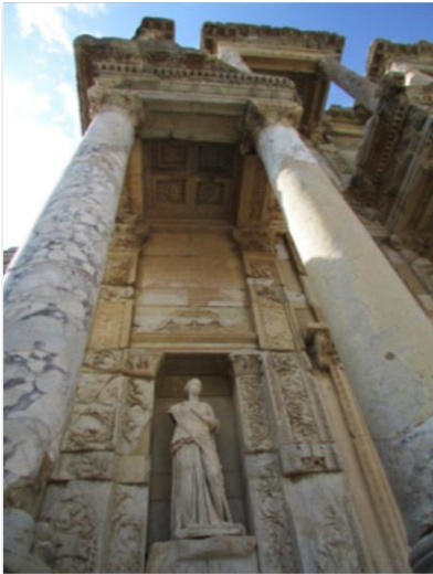
S. End of Façade with Recess and Statue commemorating the "Wisdom of Celsus" (ΣΟΦΙΑ ΚΕΛΣΟΥ).

Have you ever encountered something so extraordinary that it stopped you dead in your tracks? Caused you to stand back and just take in the magnitude of its being? If so, you understand the feeling of insignificance, mixed with awe, as you crane your head up, hand raised to fend off the sun's glare. It's hard to describe, but this is the best way to explain what I experienced when seeing the Library of Celsus for the first time.