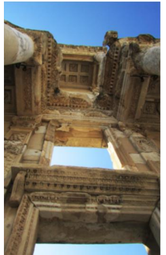
Coffer of the Library

Against my better judgment, I remained at the top of the paved path leading to the Library and waited for my fellow tourists. It seems this was destiny, as no sooner than two minutes after I had sat down to wait, the clouds parted and sunshine hit the structure, revealing a beautiful sight: complete vacancy. I leapt up, knowing the gods were only so generous and that I may never have another chance. Accompanied by a friend who had also gone ahead, we hastily made our way down to take