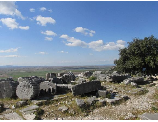
Toppled Column Drums from the Temple of Athene Polias, Priene

the structures themselves were colossal! Photographs hardly do justice to the grandeur and scale of these structures, but believe me when I say that even with partially erect columns there was a feeling of being an ant in a giant's world. In the temples, you could easily imagine the gods as giants in these great buildings answering prayers and wishes. Similarly, the Haghia Sophia and the Blue Mosque created an atmosphere of paradise, a true house of God, with their elaborate designs and monumental scales.