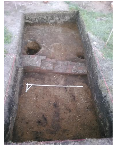
Foundation from Port Tobacco

The final objective of the print shop excavation is public presentation of the ongoing research. This enables us to converse with visitors about the landscape and relate it to the interpretive narrative detailed in the museum exhibits and docent-led tours. The ability to see a foundation from a long-gone building helps visitors begin to visualize the town that was. Why is it important to see the