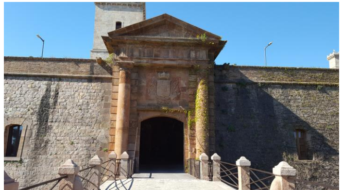
Entrance to the Fortress at Montjuïc