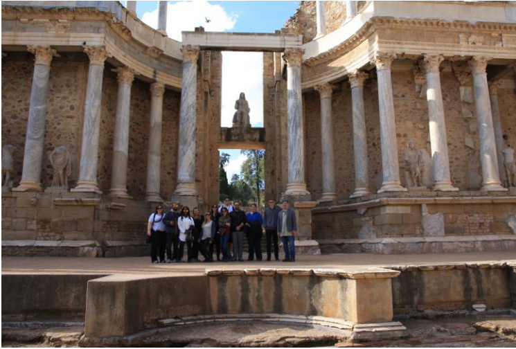
Theater at Mérida

We returned to Madrid that afternoon, once more driving through the wide, picturesque countryside of central Spain. Our bus driver, who also drove tour buses through the capital, gave us one final sweeping look at the majestic city. We got a lovely look at the Royal Palace and the striking Catedral de la Almudena, but perhaps the best last treat was the unexpected Egyptian temple of Debod, a gift to Spain from Egypt on the occasion of the building of the Aswan Dam in the 1960s. Then it was back to the hotel, and to one last evening in Madrid, more magnificent food, and for several of us, the heart-pounding enjoyment of a live Flamenco performance. We danced our way back to our beds, and then left, richer in spirit, brighter in mind, and perhaps a bit wider in waist, for the United States.