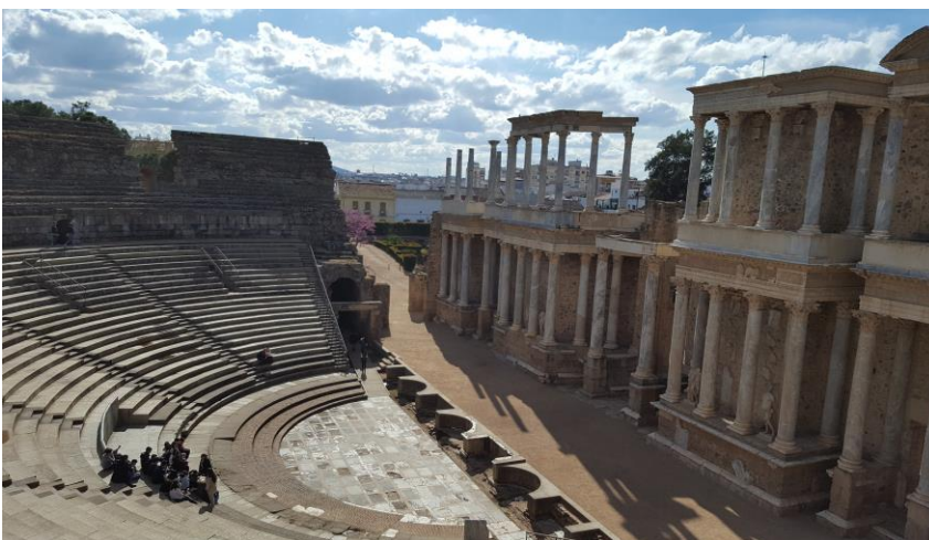
Cavea of the Theater at Mérida