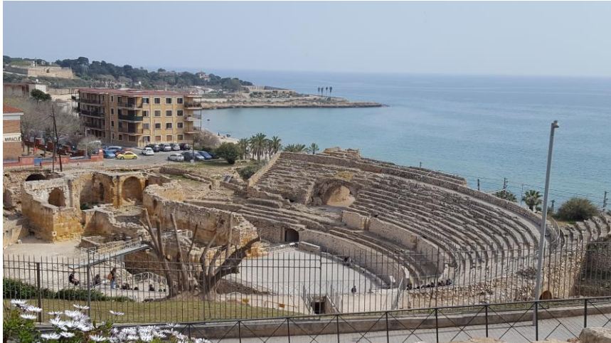
Roman Amphitheater at Tarragona

From the top of the amphitheater (photo left), you can see the spreading expanse of the Mediterranean, and every now and again hear the