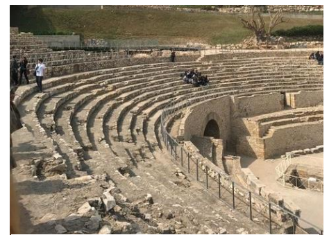
The Amphitheater in Tarragona

On the way back from Tarragona, we stopped by an aqueduct. It was so astounding to see how well preserved it was. While some reinforcements were put in more recently, the structure seemed to have stood until modernity with little help. Our group could walk across the aqueduct with ease. While it’s common to talk about how aqueducts show Roman innovation and engineering prowess, it’s hard to grasp how skilled they were until you’re