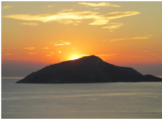
Sunset from Cape Sounion in Attica

The UMBC Ancient Studies Department will conduct its 52 nd annual study tour in Greece, March 16-25, 2018. The cost (still to be determined) will include all air and land travel, twin-share accommodation for eight nights at four-star hotels, eight buffet breakfasts, three dinners, two lunches, and entrance to all archaeological sites and museums on the itinerary. Single rooms are available at an additional cost. ANCS majors and minors, UMBC students, faculty, staff, alumni, and members of the community are invited to join us. The trip can be taken as a three-credit course in the Winter 2018 term (ANCS 301). Winter semester tuition will be waived for all UMBC students who take the course. Scholarships to help pay for the costs of the trip are available to Ancient Studies majors who enroll in the course. Places are limited, so reserve yours today! This is a wonderful opportunity to see Greece in the off season in fine spring weather. If you are interested in joining us, please contact Domonique Pitts (dpitts@umbc.edu). An initial deposit of $350.00 will be due Monday, October 16, 2017 .