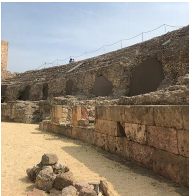
The Remains of the Circus in Tarragona

Since my freshman year, I had been seeing advertisements on myUMBC for the Ancient Studies department trips abroad. During my senior year, I finally had the opportunity to go to Spain. I was also able to enroll in ANCS 301, which gave me a richer appreciation of the sites we visited.