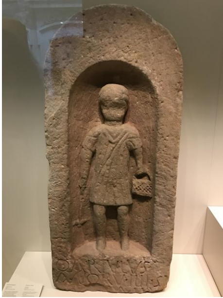
Stele of Quartulus

For me, one of the strongest pleasures of our department trip to Spain was the richness of the museums, especially their abundance of objects related to everyday life. In the city of Rome itself—which was, after all, the home of the emperors and highest elites—there are so many of the most impressive statues, paintings, and mosaics from the Roman period that objects more tied to