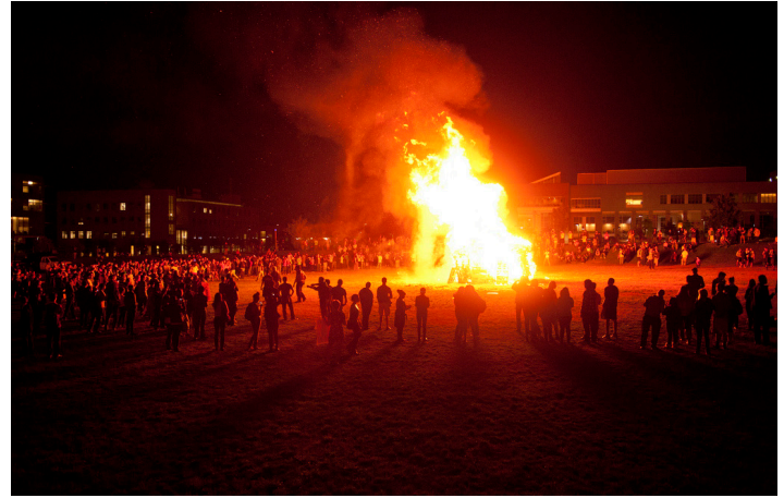
Students gather to watch the bonfire on Erikson Field