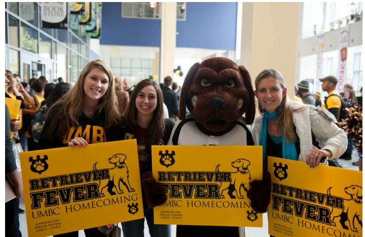
Students show their pride at the Homecoming Pep Rally

For more photos from Homecoming 2012 , visit the alumni flickr page at flickr.com/photos/umbcalumni/