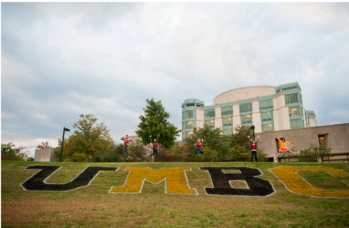
SEB jumps with joy at the UMBC logo painted on Erikson Field