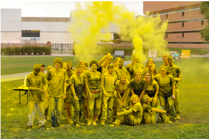
The first ever Homecoming Paint Fight