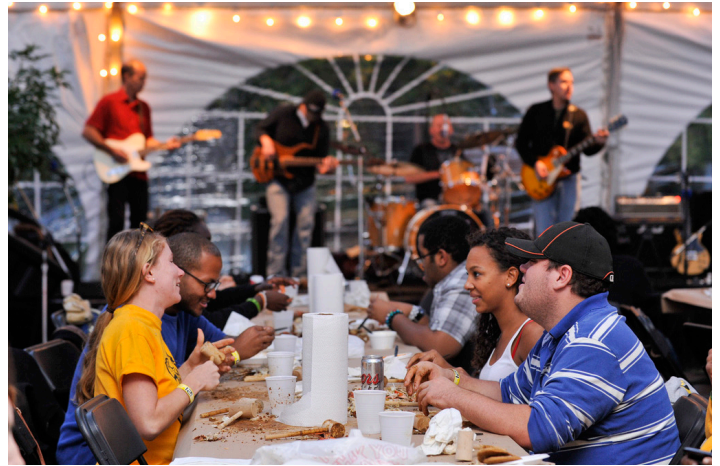
Former students enjoy the annual Alumni Crab Feast