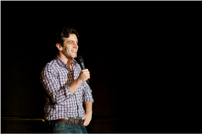
Comedian BJ Novak from The Office Performs