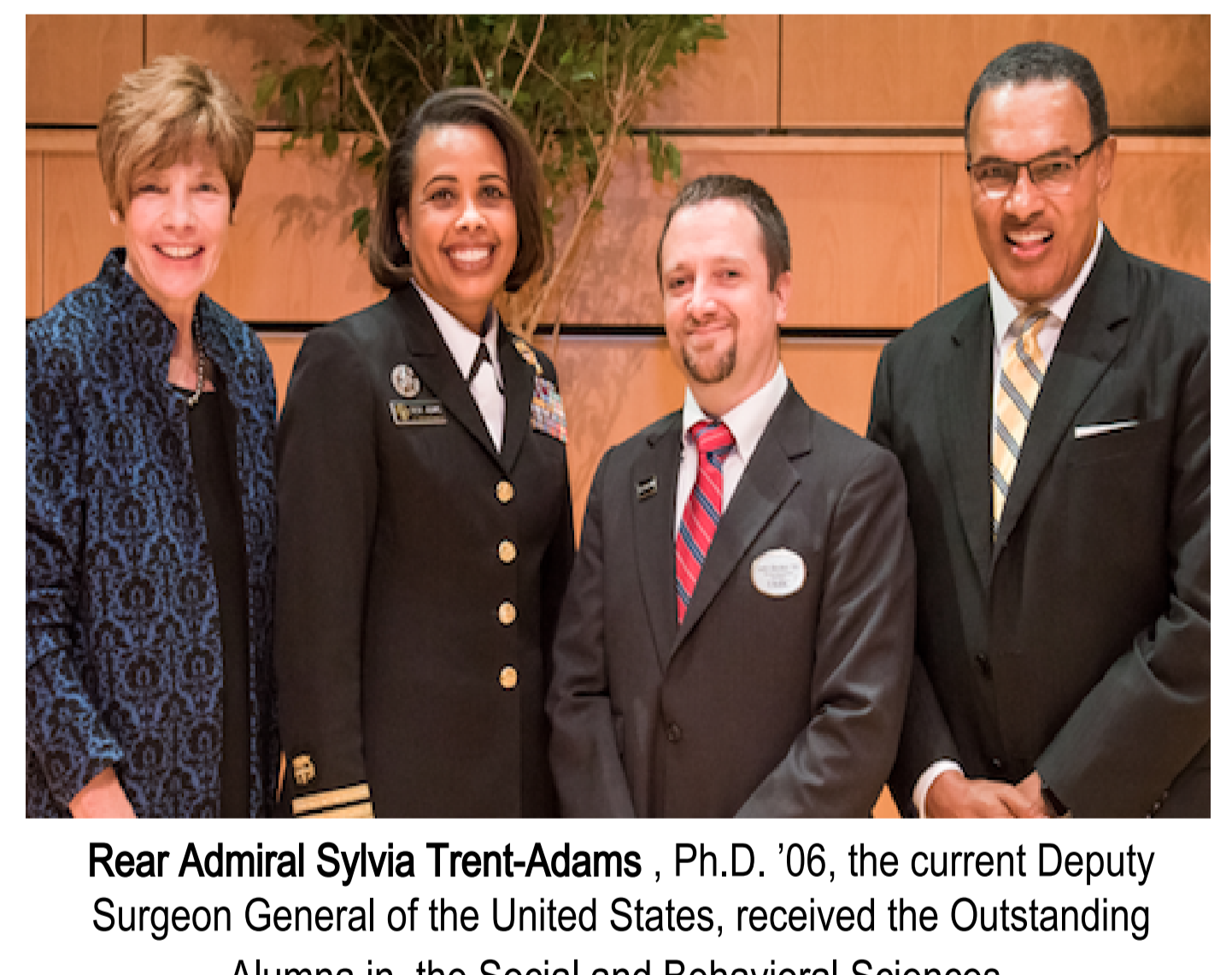
Rear Admiral Sylvia Trent-Adams, Ph.D. '06, the current Deputy Surgeon General of the United States, received the Outstanding Alumna in the Social and Behavioral Sciences.

David Muhlhause, Ph.D. '04, was appointed as the Director of the National Institute of Justice, Department of Justice.