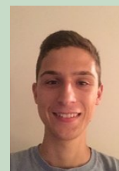
Matt M/W 7-9pm CHEM 101/102