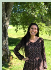
Samar T/TH 6-8pm CHEM 101/102