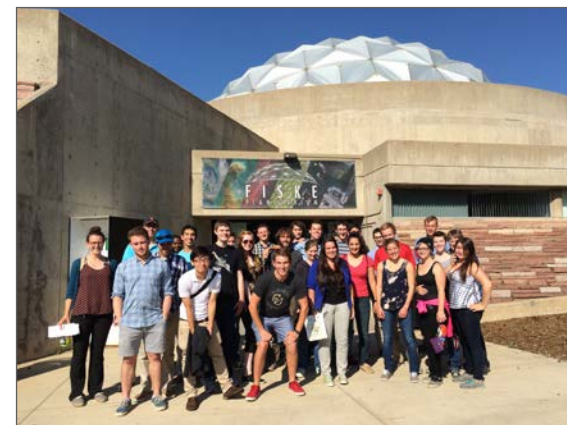
2015 REU Participants