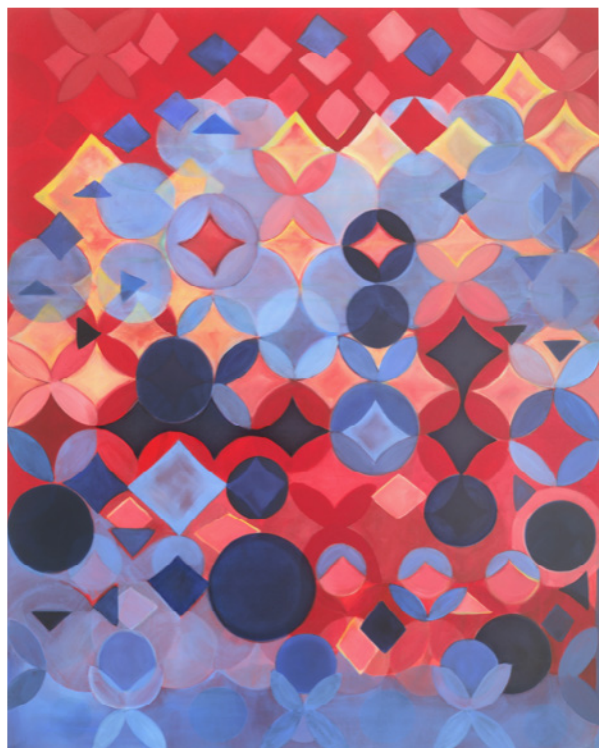
Mira Hecht, One Blue Sentence , 2012, oil on canvas, 60 x 48”; courtesy of the artist and Addison/Ripley Fine Art.

out subjects that capture the mindless activities and frenetic pace of contemporary society. To achieve the smeared effect in his digital prints, he shoots