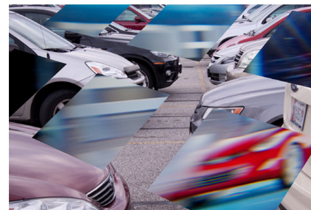
Vin Grabill, Park & Buy , 2012, giclee print on canvas, 24 x 36 x 1.5”; courtesy of the artist.

Through shape shifting imagery, Synergy Unbound underscores the relativity of simultaneous co-existence in the internal construction of the featured works and by extension, in our daily lives vis-à-vis the observer’s standpoint. While Grabill enlists jump cuts and stop motion to jar conventional awareness, Hecht favors overlaps and transparency in her transitions to prompt glimpses into worlds that transcend observable reality. Together, both artists offer a fresh possibility of abstract navigation through actual and imagined realms as the momentum in their art reverberates into the big beyond.